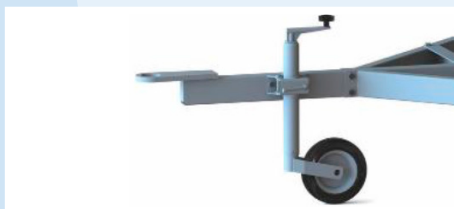
Jockey wheel as an option.

Changes possible. All rights reserved. 2018.11