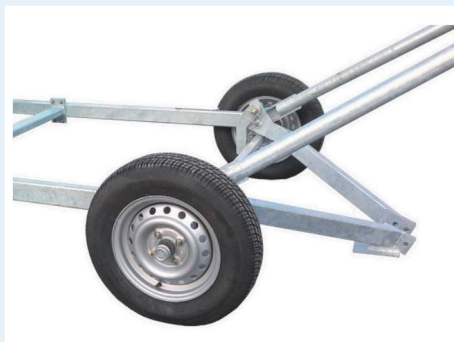
The transport locking triangle becomes an anti-tipping triangle during use.

Flow: wheat 0,75 t/m 3 , maximum humidity 15%. A higher humidity or an improperly cleaned grain can reduce the flow.