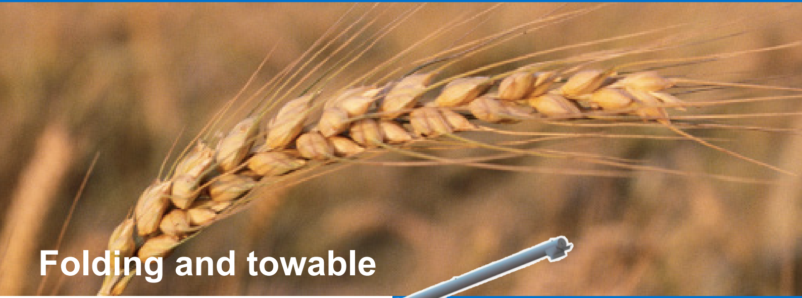
Mobile auger 200