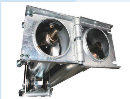
Robust hinge with a bearing in bronze.